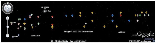
Figure 2. Traditional annotations in Google Sky. The picture contains only about 60 annotations, yet the information is almost illegible.

The client receives the images, cross-registers them, computes the pixel-based overlay and displays it. The cross-registration and overlay operation involves projecting each image from a rectangular grid onto the sky, zooming in and out to account for telescope parameters, changing transparency etc. The visualization is accomplished using WebGL -- a web standard that provides a 3D graphics API implemented in a web browser without the use of plug-ins [2]. The client finally renders the scene to an HTML Canvas element, where the visualization scenegraph consists of a sphere with the camera at the center looking out.